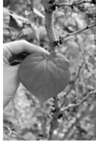
Cercis canadensis eastern redbud