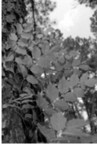
Campsis radicans trumpet creeper