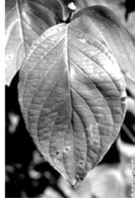
Cornus florida flowering dogwood