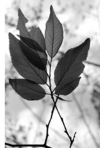
Prunus mexicana Mexican plum